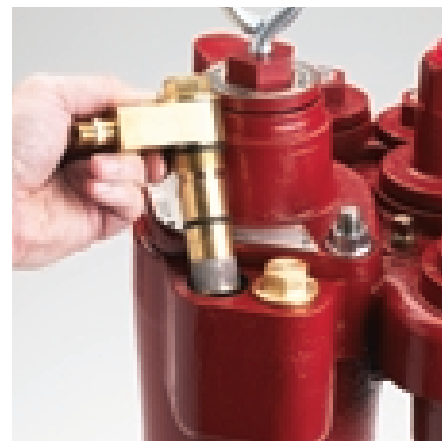
Red Jacket Vacuum Sensor Siphon System