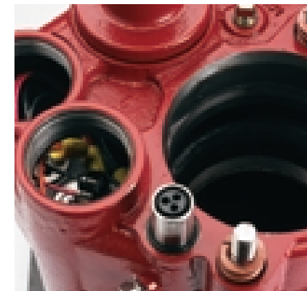
Pre-installed capacitor and simple electrical connections

With The Red Jacket Submersible Turbine Pump you turn off the circuit breaker, then simply back off the two nuts holding the extractable in place and the yoke electrical connection is broken. After service is complete, the electrical circuit reconnects when the two nuts are retightened. Safe, simple and easy.